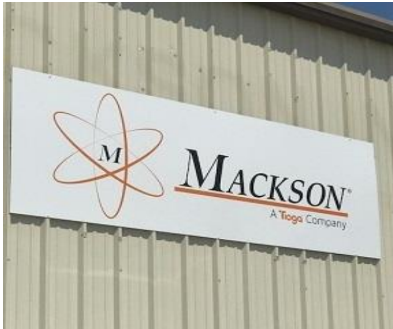
New Sign in Rock Hill, SC

* Whitepaper: Seamless A106B & A106C vs Seamless A53B